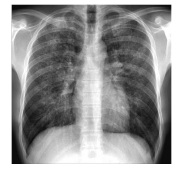
Figure 2: Chest radiography in a patient with absolute neutrophil count <0.1 x 10^{9} /L: "masked" pneumonia.

and septic shock were the most reported infections<sup>1,2,8</sup>. To date, classical manifestations as necrotic tonsillitis and perinea gangrene or are exceptional. Beside these "loud" manifestations, clinicians must keep in mind that the signs of these infections may be sometimes crude and atypical because of the neutropenia.