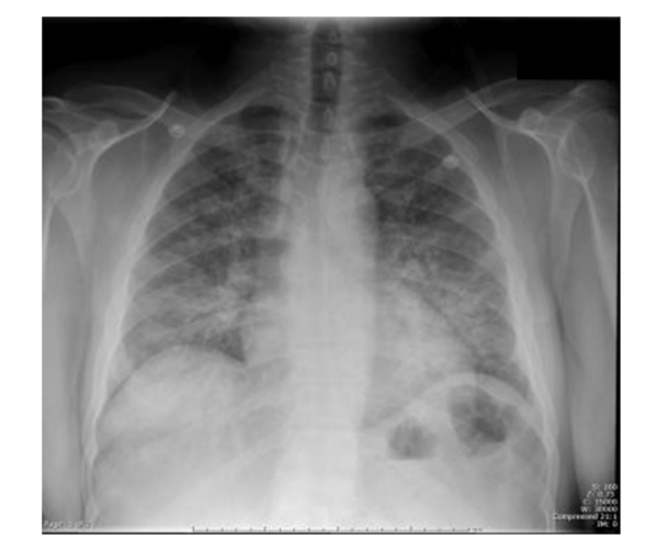
Figure 1: Chest radiography in a patient with absolute neutrophil count <0.39 \times 10^9 /L: bilateral extensive pneumonia.

Initially, symptomatic patients with idiosyncratic drug-induced severe neutropenia and agranulocytosis usually present with fever, which often is the earliest and sometimes the only sign during evolution. This later is often associated with general malaise, often including chills<sup>1,2</sup>. Symptoms may appear either immediately or